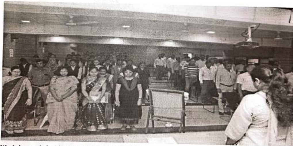
Workshop ended with singing of National Anthem